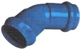
uPVC Elbow 22.5°

Jointing Method (for elbow): INTEGRAL FIXED SEAL TYPE