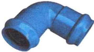
uPVC Elbow 90°