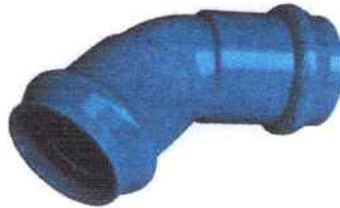
uPVC Elbow 45°